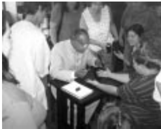
Take a number please! Lots of people lined up to get their hands read during the book tour!

Lastly, there is a correspondence course in palmistry which is in the process of completion. Watch for it, and let us know if you are interested in participating in this exciting new program.