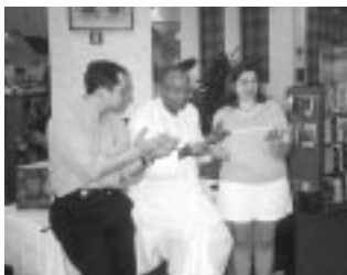
Want to show us your hands? Volunteers from the audience offer to share their hands at a book signing!

He also received a great response from the press and was featured in a number of magazines, including: Cosmopolitan , Modern Woman , Seven Days , and Insight .